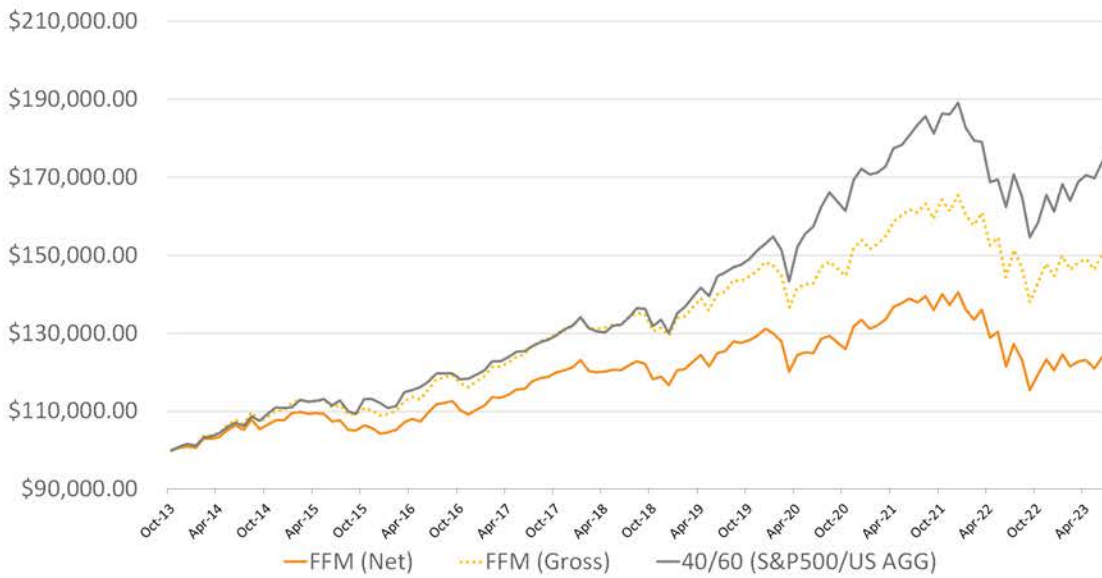
Hypothetical Growth of $100,000 Over the Last 10 Years